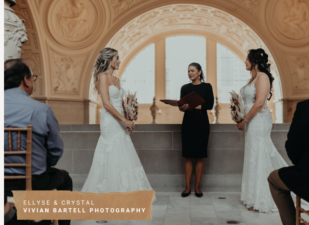
ELLYSE & CRYSTAL VIVIAN BARTELL PHOTOGRAPHY

See example Ready Made Ceremonies here .