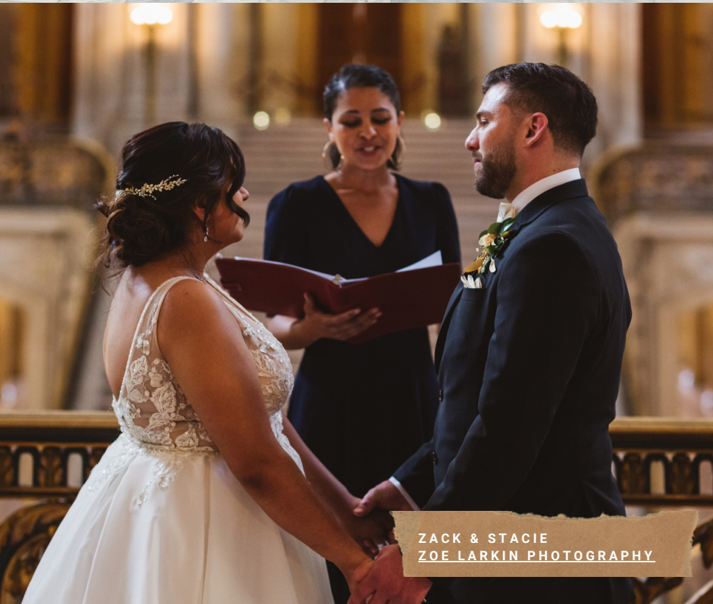
ZACK & STACIE ZOE LARKIN PHOTOGRAPHY