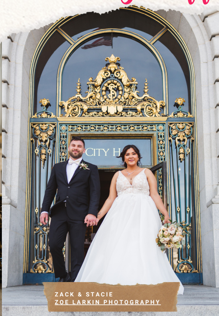
ZACK & STACIE ZOE LARKIN PHOTOGRAPHY