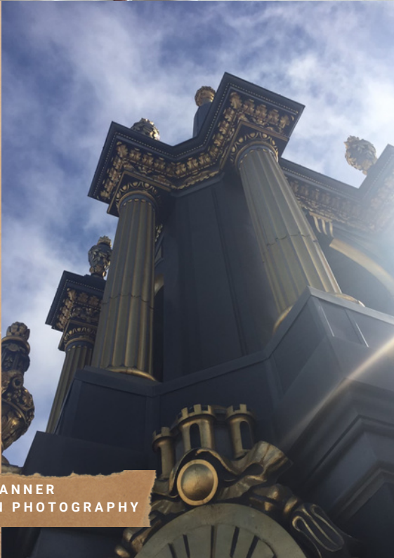
RACHAEL TANNER