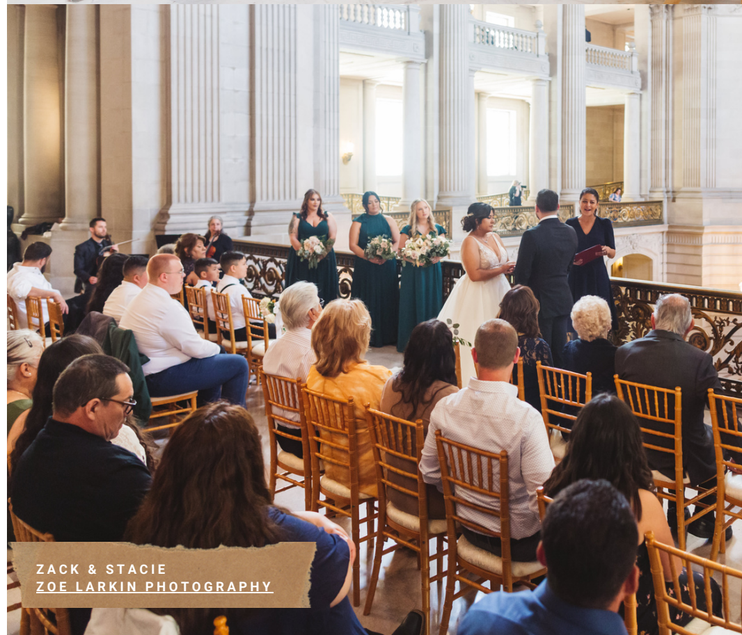
ZACK & STACIE ZOE LARKIN PHOTOGRAPHY